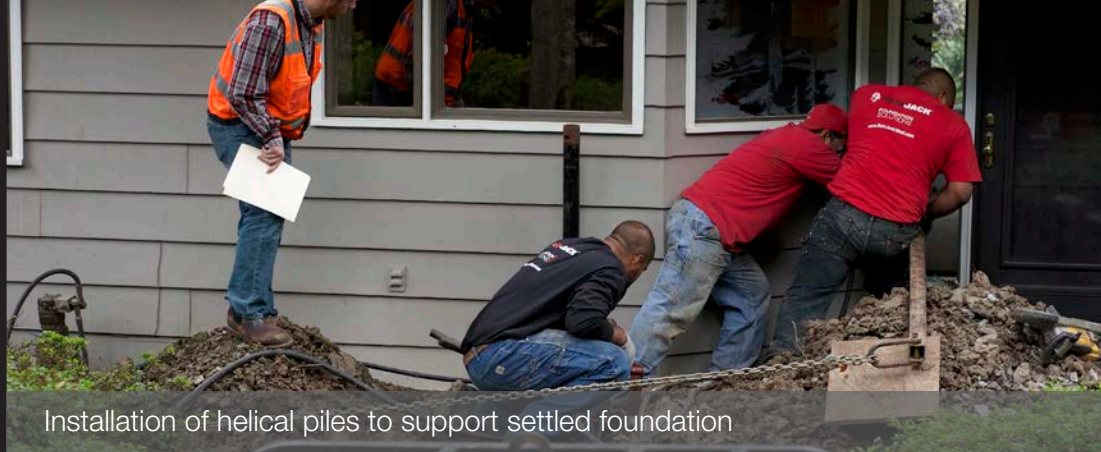
Installation of helical piles to support settled foundation

EUGENE, OR 866-472-6522 www.ramjackwest.com