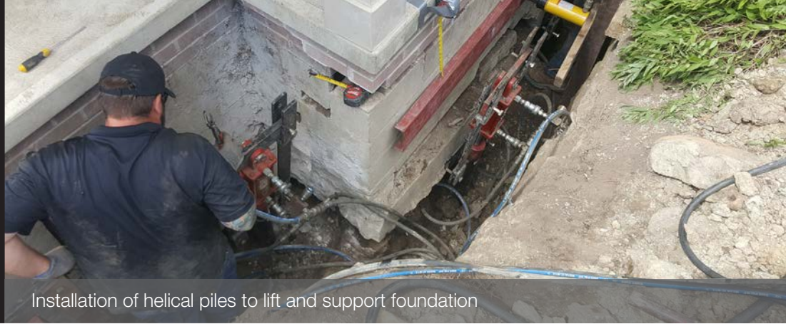
Installation of helical piles to lift and support foundation